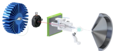
Figure 2 - Schematic of the Luxon Ionization Source