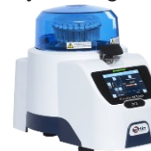
Figure 3 – Hair pulverization system (Precellys 24 Touch) from Bertin Technologies, Montigny-le-Bretonneux, France.

To remove undesired Cortisol from the hair surface, 1 mL of isopropanol (IPA) was added to the samples, and they were soaked for 3 minutes at room temperature. The washing solution was then discarded. This washing step was repeated twice. Afterwards, samples were dried with air flow (5 psi) for 60 minutes. Next, the cleaned hairs were pulverized into a fine powder (3 X 60 sec at 6500 rpm, 15 seconds pause time) using a Precellys 24 Touch system (Figure 3).