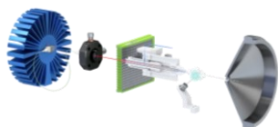
Figure 2 - Schematic of the Luxon Ionization Source