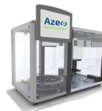
Figure 3 - Automated extraction system