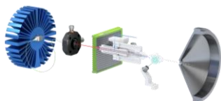
Figure 2 - Schematic of the Luxon Ionization Source