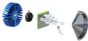
Figure 2 - Schematic of the Luxon Ionization Source