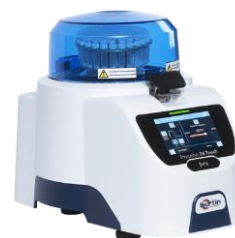
Figure 3 – Hair pulverization system (Precellys 24 Touch) from Bertin Technologies, Montigny-le-Bretonneux, France.