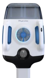
Figure 1 - Luxon Ion Source®

The Luxon Ion Source® (Figure 1) is the second-generation sample introduction and ionization source based on the LDTD® technology for mass spectrometry. Luxon Ion Source® uses Fiber-Coupled Laser Diode (Figure 2) to obtain unmatched thermal uniformity providing more precision, accuracy, and speed. The process begins with dry samples which are rapidly evaporated using indirect heat. The thermally desorbed neutral molecules are carried into a corona discharge region. High efficiency protonation and strong resistance to ionic saturation characterize this type of ionization and is the result of the absence of solvent and mobile phase.