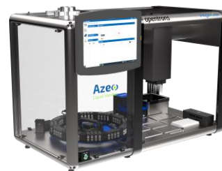
Figure 3 - Automated extraction system