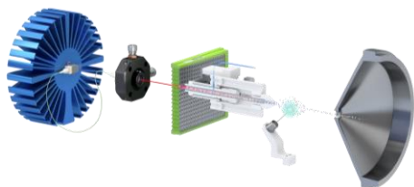
Figure 2 - Schematic of the Luxon Ionization Source